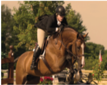
TRELLA BOND/OPUSHA, INC. NY NY